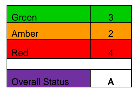
Objective 1: An inclusive workforce that feels valued, respected and reflects our community

If two thirds of the indicators within a priority are a particular status then this will determine its status. If not, then the priority status will become Amber.